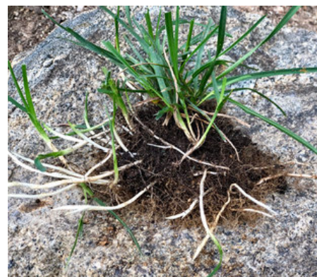
Close-up of live plant with rhizomes leading to new plant.