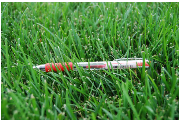
Pen showing leaf size