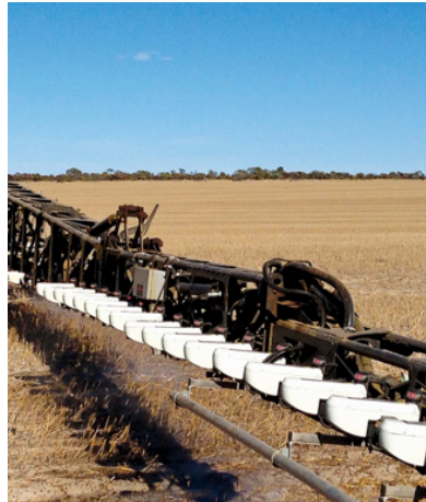
Spraying Fallow Paddocks